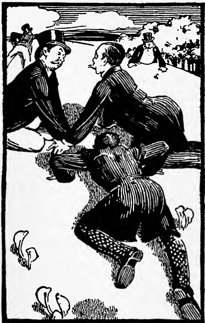
CITY MEN OUT ON ALL FOURS IN A FIELD COVERED WITH VEAL CUTLETS